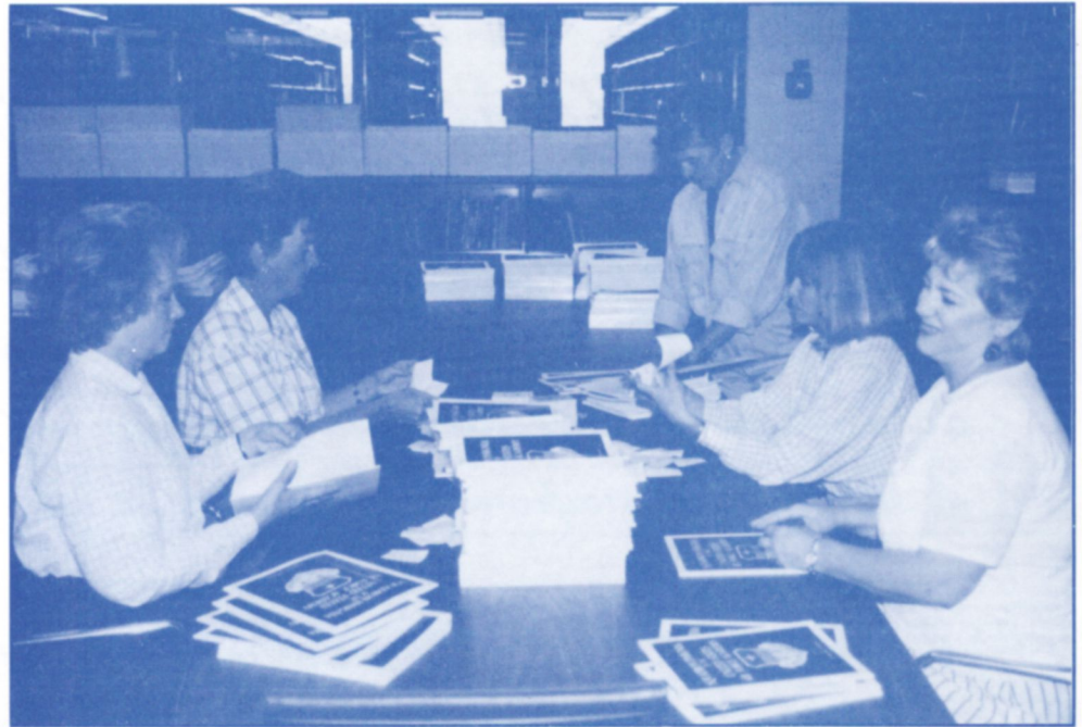
Members of the Academy Officers Wives Club Help With Friends' Mailing