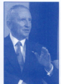
Mr. H. Ross Perot