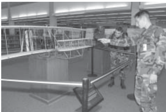
The quarter-scale model of the 1903 Wright Flyer on display for cadets, faculty, and staff.