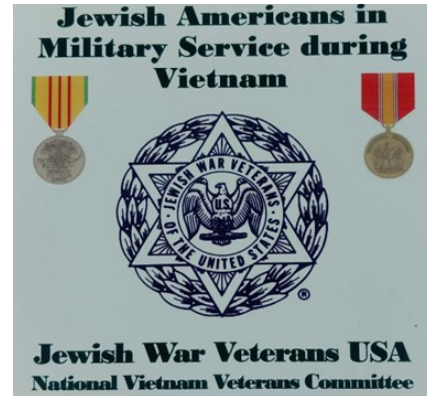
Cover artwork for the 90 Vietnam War Veterans' Narratives book.

Researchers seeking a deeper understanding of the intersection of faith and wartime service will find great value in this collection. Americans of many faiths fought and died in the Vietnam War, as they did in all United States armed conflicts. These Jewish veterans' narratives exemplify the role of faith while enduring combat.